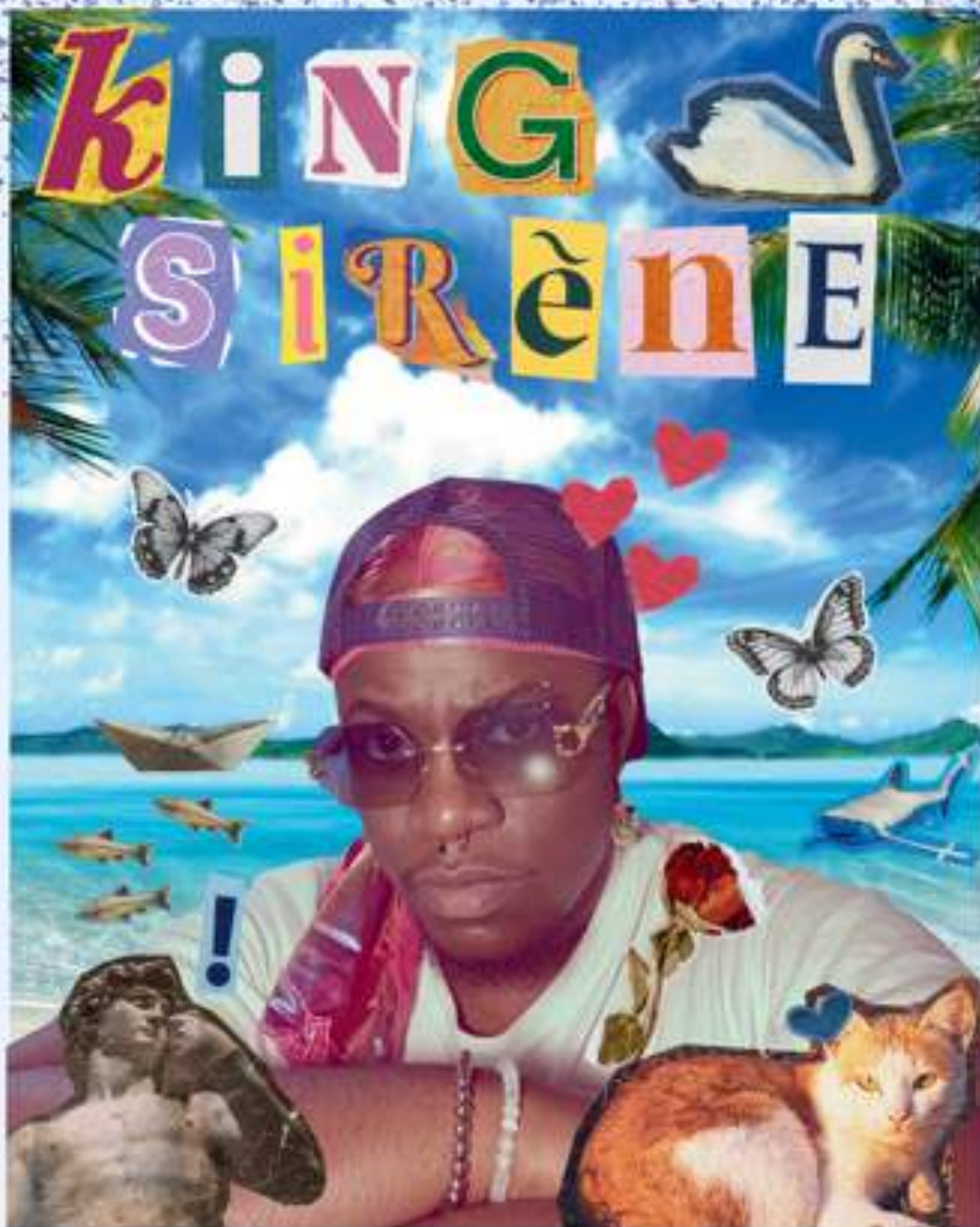
"KING SIRÈNE" by Krow Sirène Iroquois