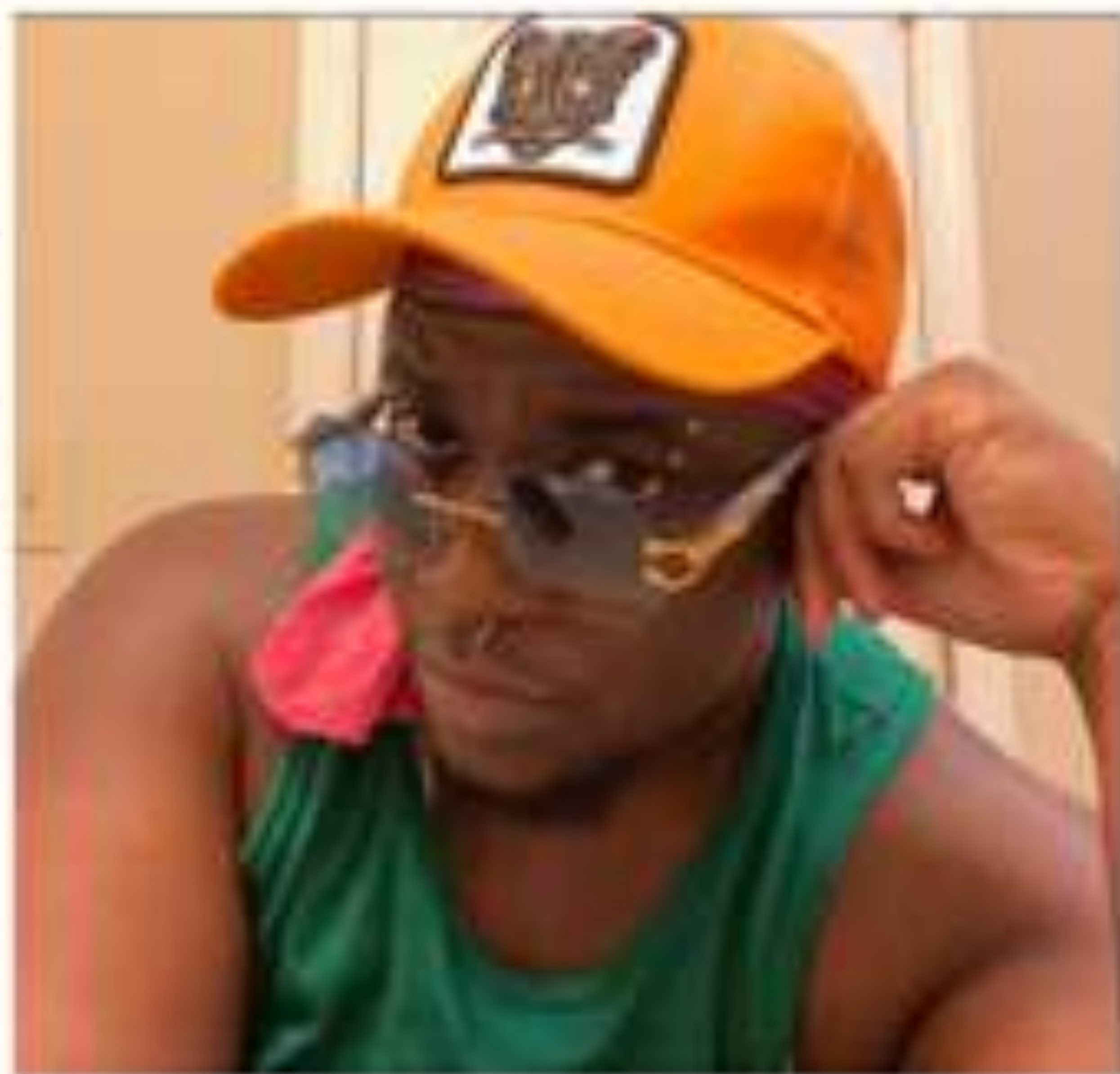
KROW SIRÈNE IROQUOIS