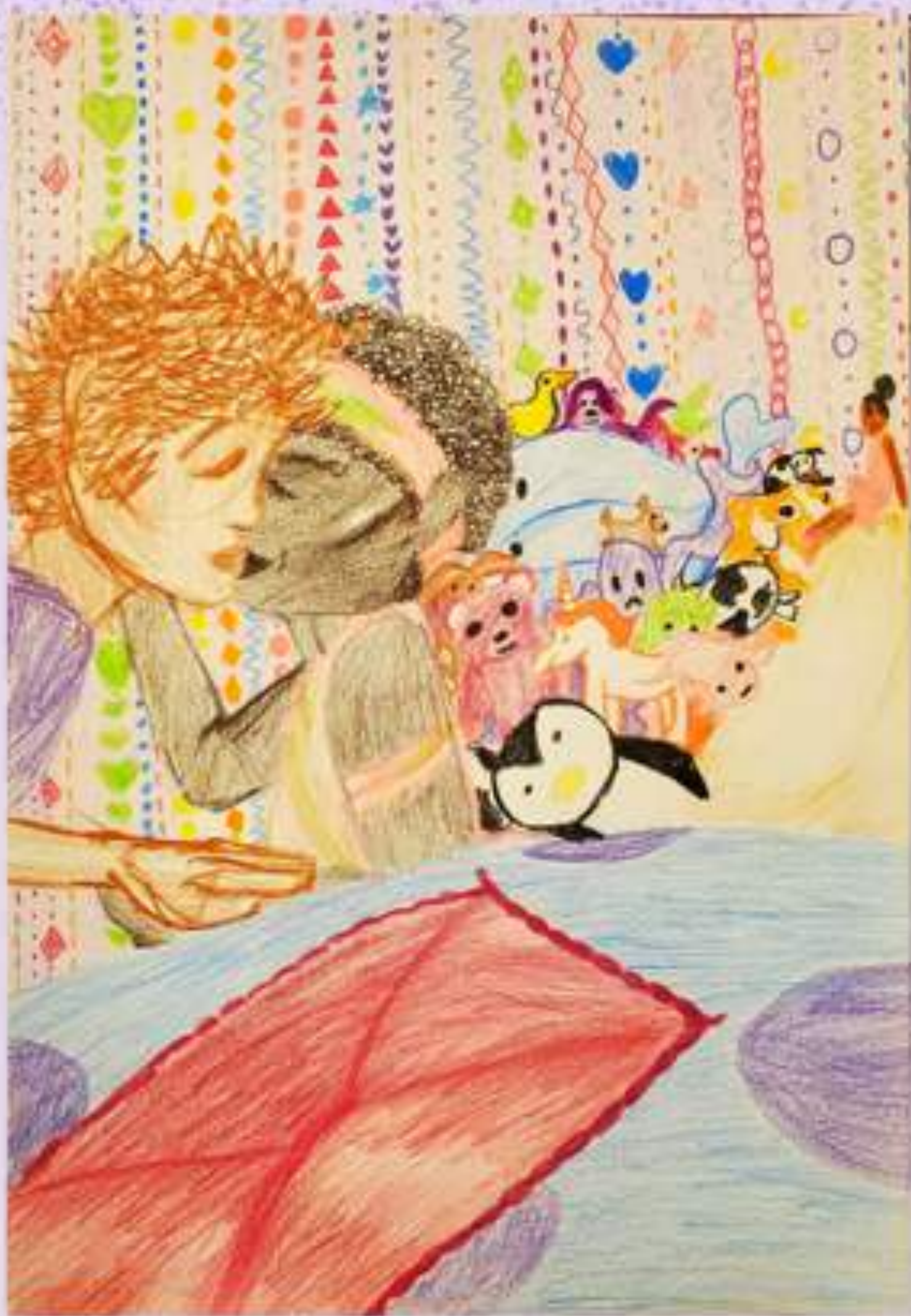
"Childhood Bedroom" by Harvey Reyes