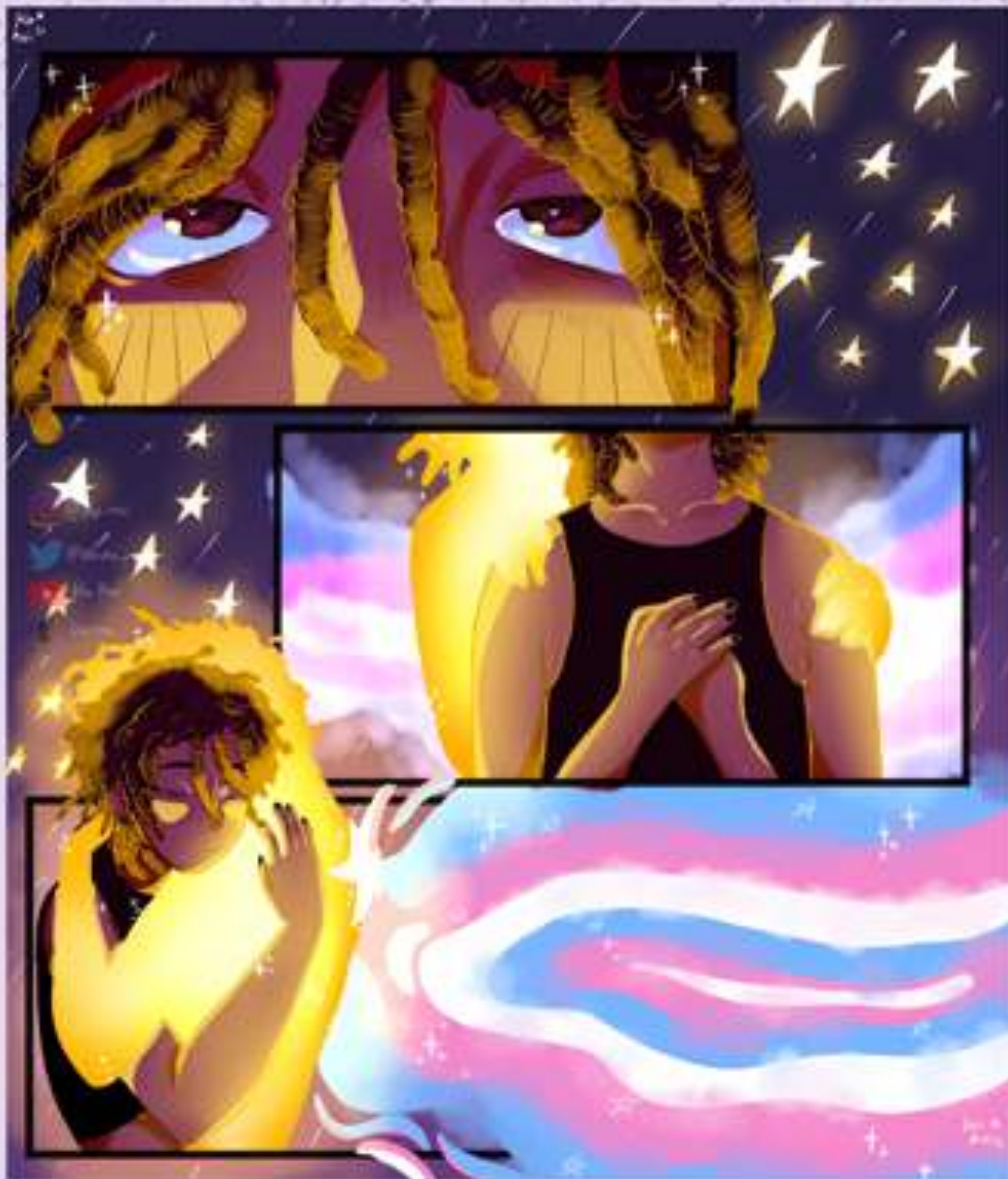
"The Warmth of Gender Euphoria" by Kio Wallace